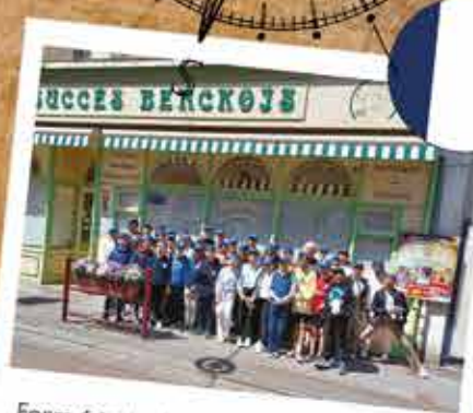
Form 6 ignited their intercultural curiosity and developed their independent thinking in France.