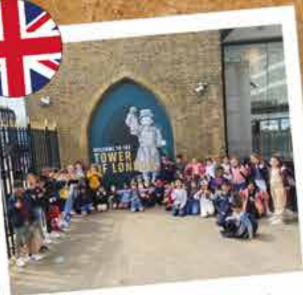
Form 4 enjoyed London's top attractions and national heritage.