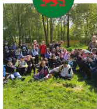
Form 5 immersed themselves in the natural world in Wales.